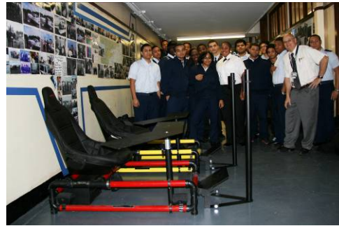
4 new units for the school