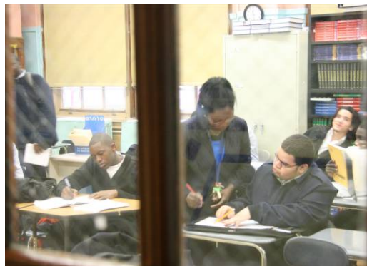
Class Room Work