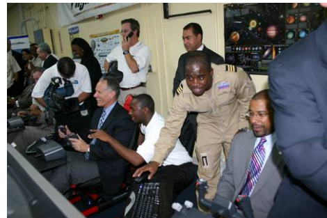
State and Local Officials