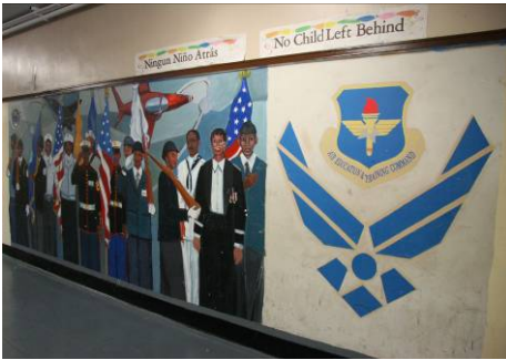
No Child left Behind