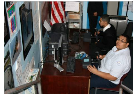
The old way of Flight