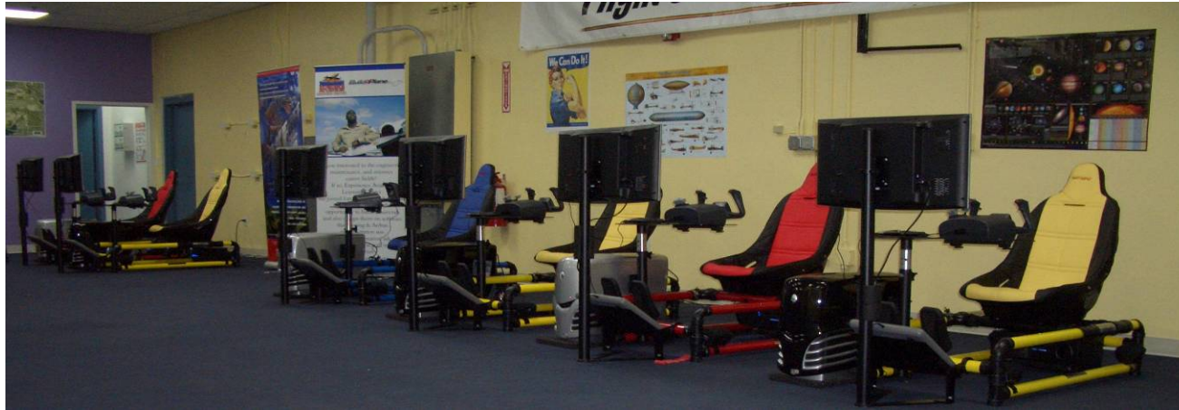
HotSeat Flight Sims @ Experience Aviation, Miami FL.